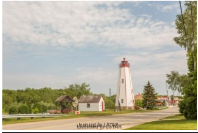
Port Burwell Lighthouse