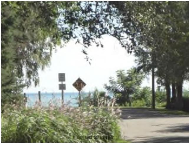
end of Elizabeth Street