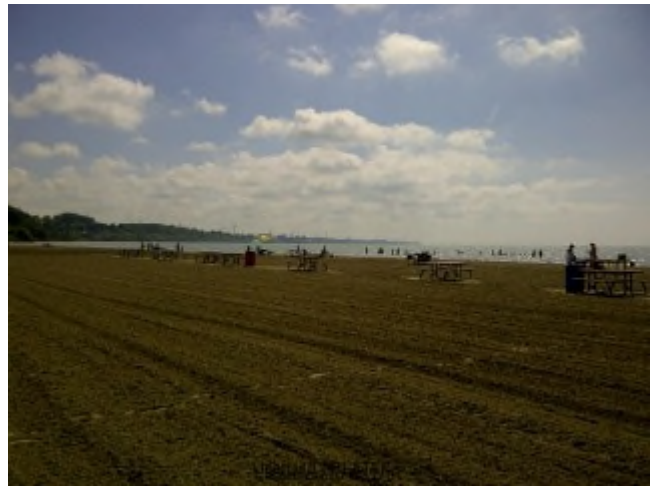
Port Burwell Beach